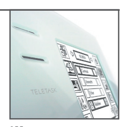
illus user manual